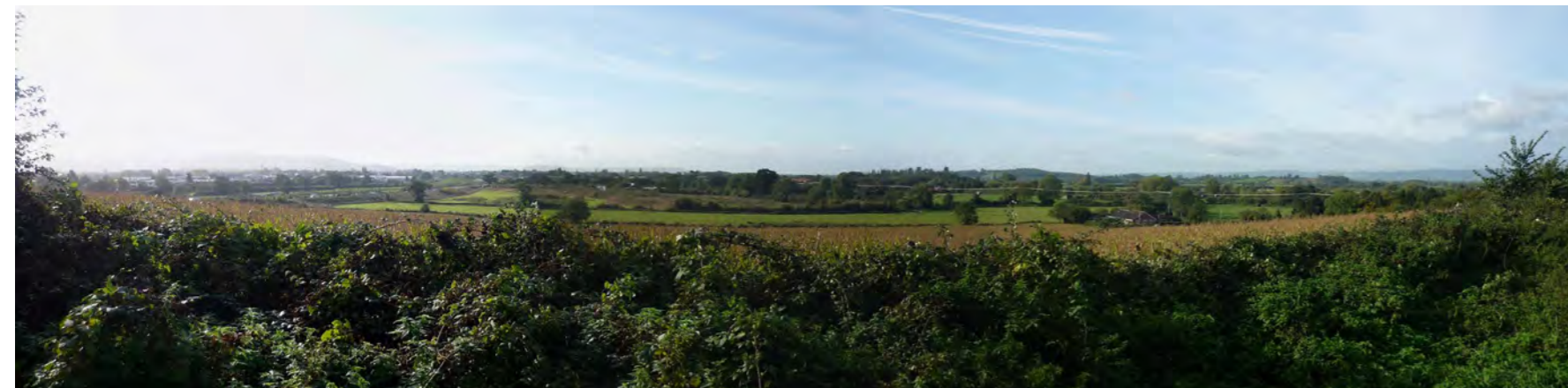
Photograph 1: Looking south-east to south-west across the Site. Panoramic views to the A430 and industrial development to the south-east, landscape screening and glimpse views to the sewerage works (south), Wooded hills of Hockley Hill and Windmill Hill, River Severn and fields and hedgerows to the south-west.

This map is reproduced from Ordnance Survey material with the permission of Ordnance Survey on behalf of the Controller of Her Majesty's Stationery Office © Crown copyright. Unauthorized reproduction infringes Crown copyright and may lead to prosecution or civil proceedings. Licence no 100019169. 2013.