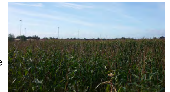
Photograph 2: Looking south towards Site. Currently used as arable farming land, industrial units to the south partially visible and lighting and tree planting along the A430. Lower topography and crops restrict views.