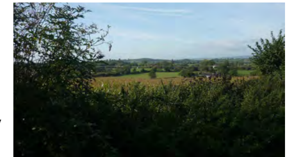
Photograph 3: Along Public Right of Way looking south-west towards Site. Higher topography along ridge line allows views across site and surrounding hills, countryside and residential buildings along Rea Lane.