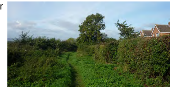
Photograph 5: View along northern Site boundary looking west. Second story views from rear winders of adjacent residential properties.

This map is reproduced from Ordnance Survey material with the permission of Ordnance Survey on behalf of the Controller of Her Majesty's Stationery Office © Crown copyright. Unauthorized reproduction infringes Crown copyright and may lead to prosecution or civil proceedings. Licence no 100019169. 2013.