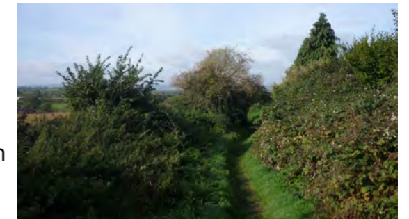
Photograph 4: View along northern Site boundary looking west. Landscape buffer on either side of Public Right of Way allows intermittent glimpse views to Site.