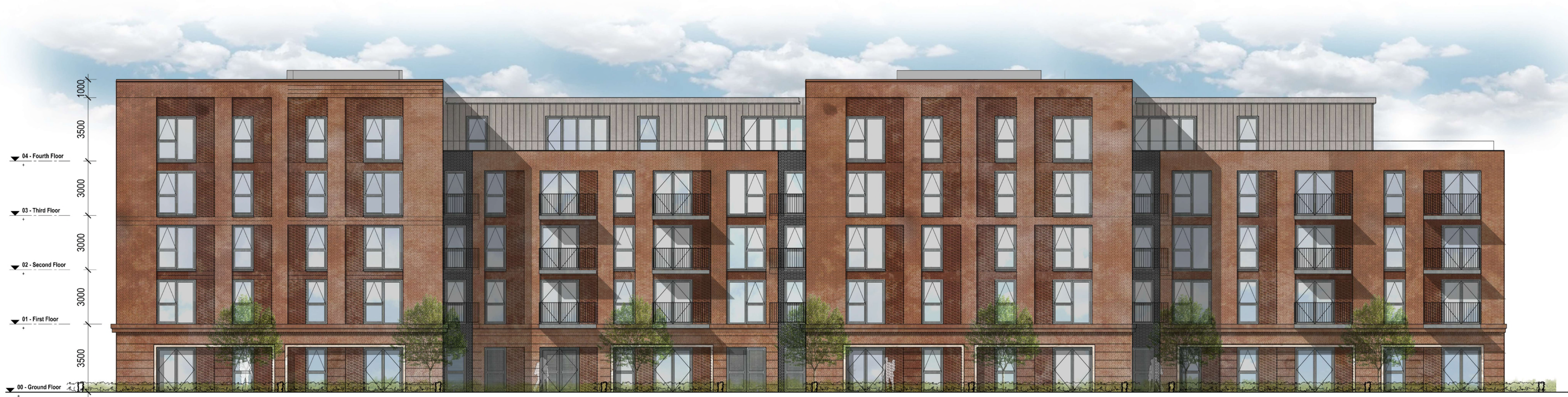
B Elevation B - Back SCALE 1:125