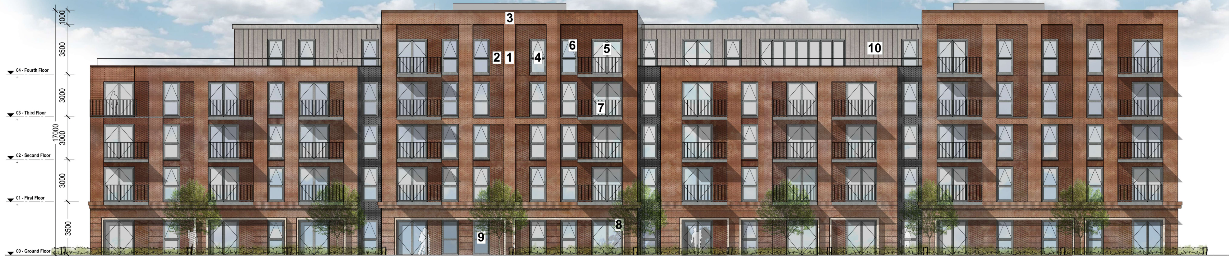
A Elevation A - Front SCALE 1:125