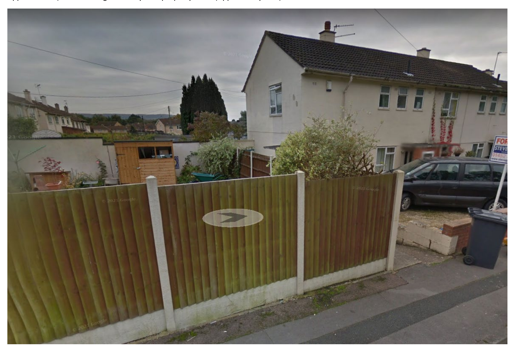
Appendix 6avi) 1.8m fencing at nearby new property No. 2 (Approved by GCC):