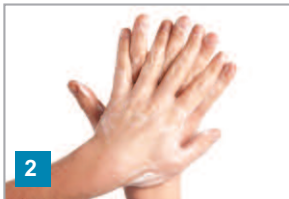
2 Clean between fingers; right hand over left and left over right