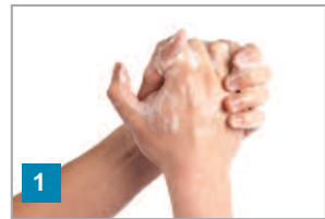
1 Wet hands, apply soap and lather palm to palm

Instructions on good hand washing techniques are given below: