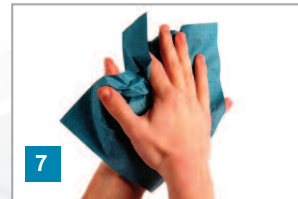
7 After washing, rinse hands under running water and dry thoroughly on paper towels