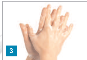
3 Wash palm to palm with fingers interlaced