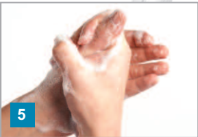
5 Clean left thumb with rotational movement of right hand and vice-versa