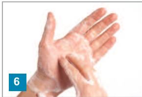
6 Rotational rubbing of palms; right fingers to left palm and vice-versa