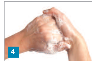
4 Wash with backs of fingers to opposing palms, fingers interlocked