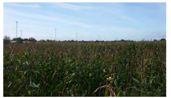
Photograph 2: Looking south towards Site. Currently used as arable farming land, industrial units to the south partially visible and lighting and tree planting along the A430. Lower topography and crops restrict views.