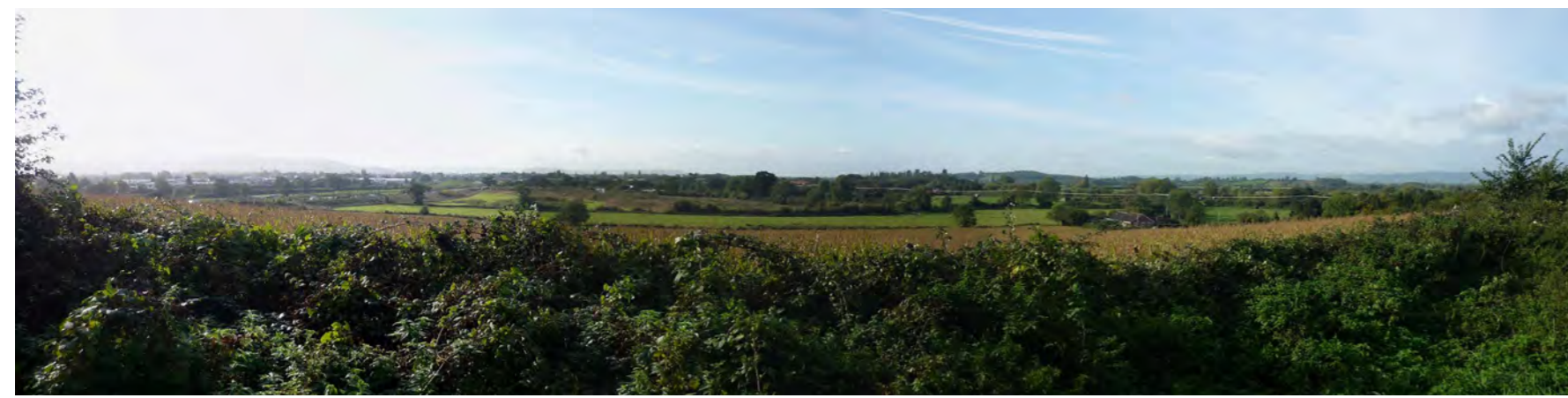
Photograph 1: Looking south-east to south-west across the Site. Panoramic views to the A430 and industrial development to the south-east, landscape screening and glimpse views to the sewerage works (south), Wooded hills of Hockley Hill and Windmill Hill, River Severn and fields and hedgerows to the south-west.

This map is reproduced from Ordnance Survey material with the permission of Ordnance Survey on behalf of the Controller of Her Majesty's Stationery Office © Crown copyright. Unauthorized reproduction infringes Crown copyright and may lead to prosecution or civil proceedings. Licence no 100019169. 2013.