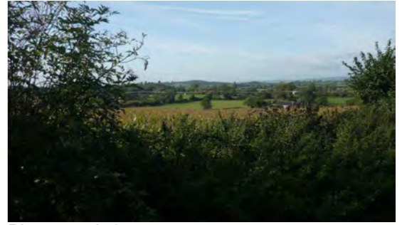
Photograph 3: Along Public Right of Way looking south-west towards Site. Higher topography along ridge line allows views across site and surrounding hills, countryside and residential buildings along Rea Lane.