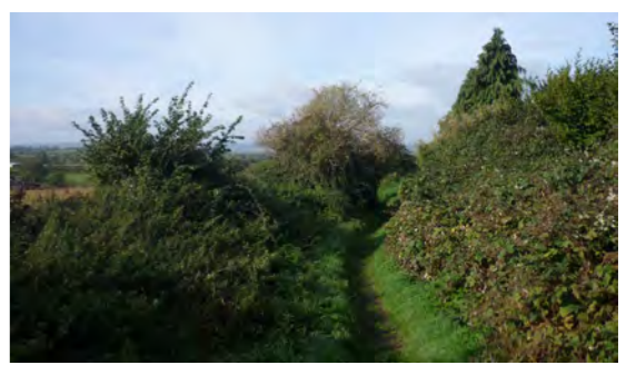
Photograph 4: View along northern Site boundary looking west. Landscape buffer on either side of Public Right of Way allows intermittent glimpse views to Site.