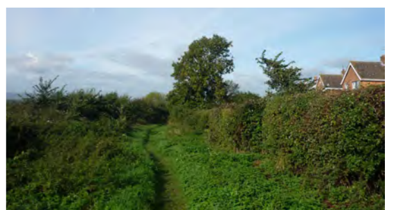
Photograph 5: View along northern Site boundary looking west. Second story views from rear winders of adjacent residential properties.