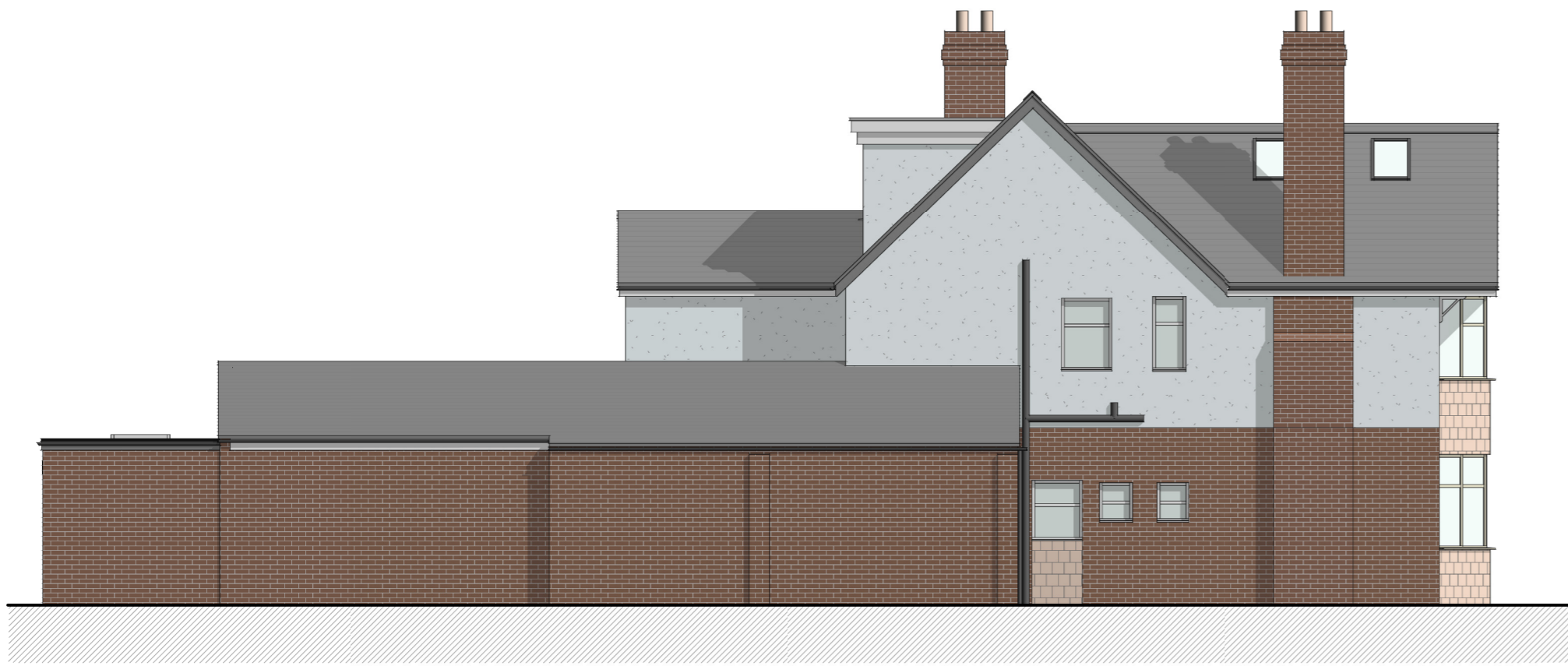
Side Elevation (West)

This drawing is to be read in conjunction with all relevant consultant's drawings/documents and any discrepancies or variations are to be notified to Apex Architecture Ltd before the affected work commences.