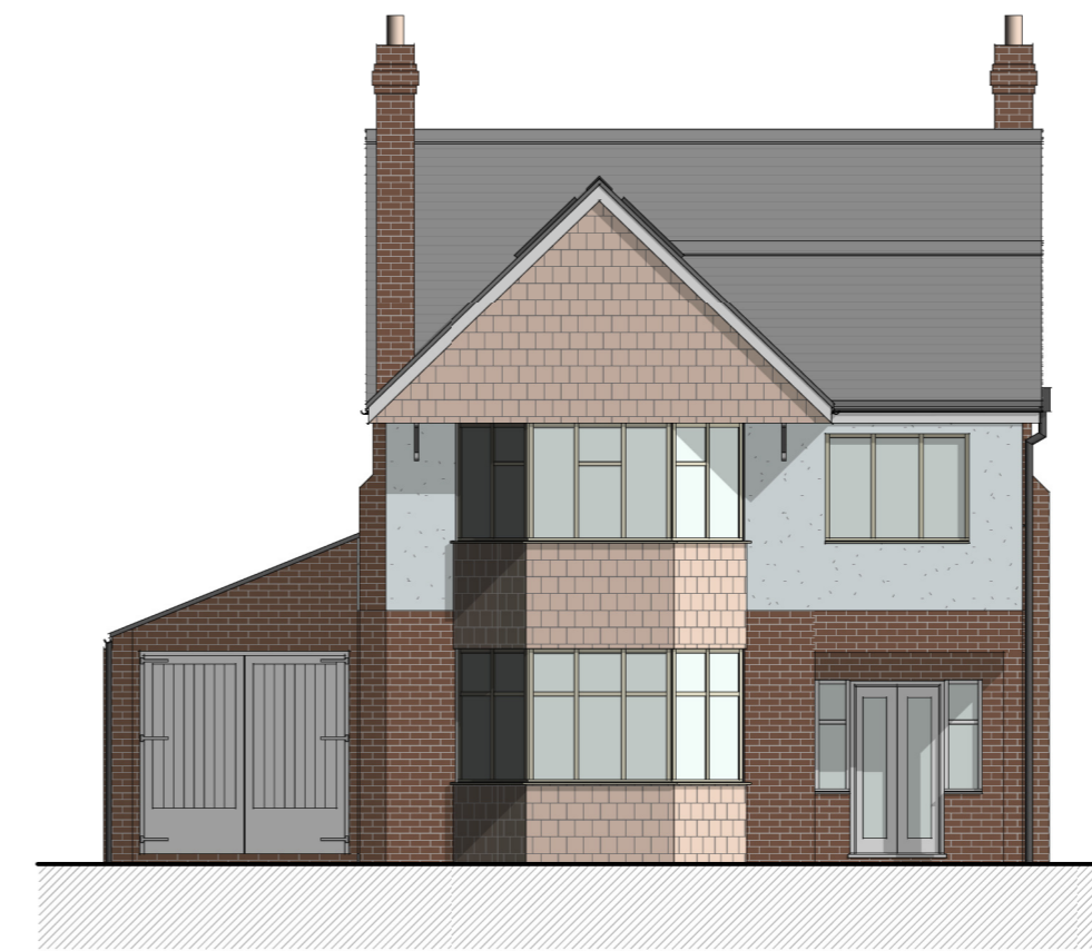
Front Elevation (South)