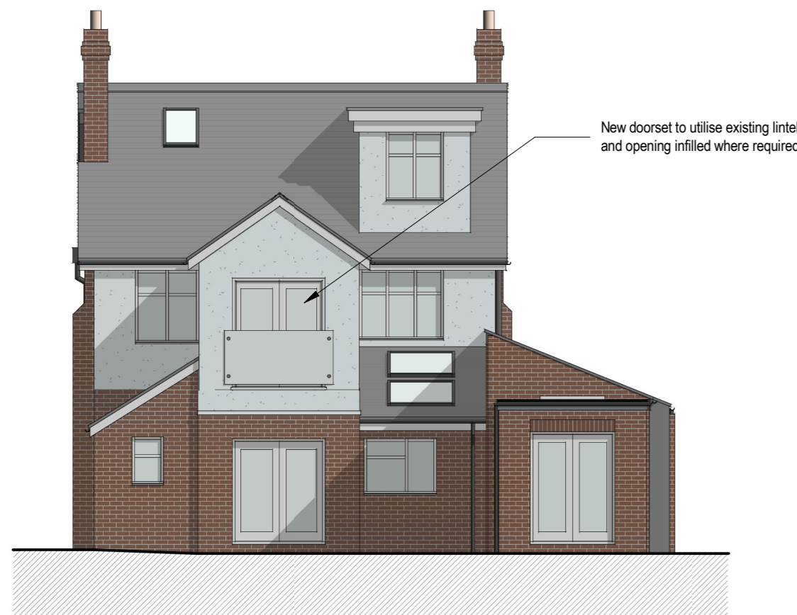
Rear Elevation (North)