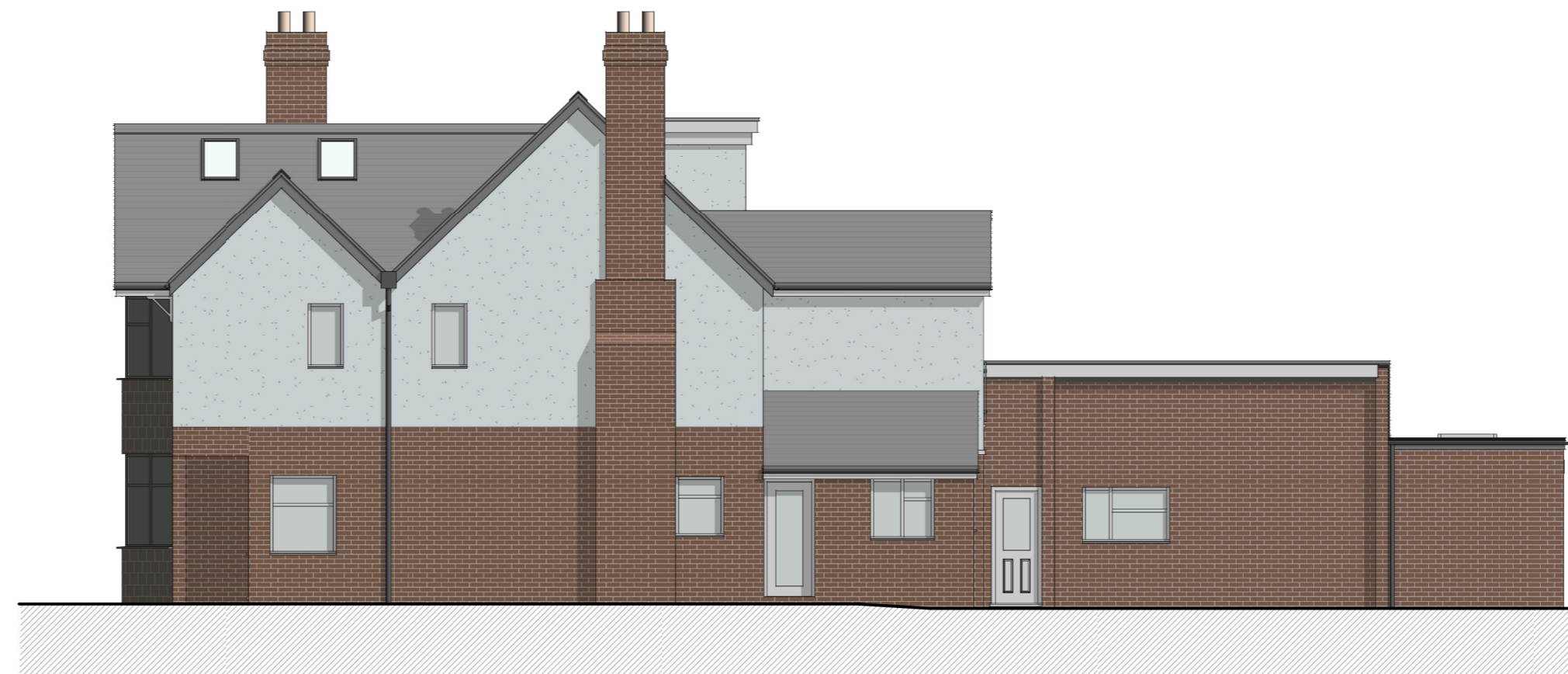
Side Elevation (East)