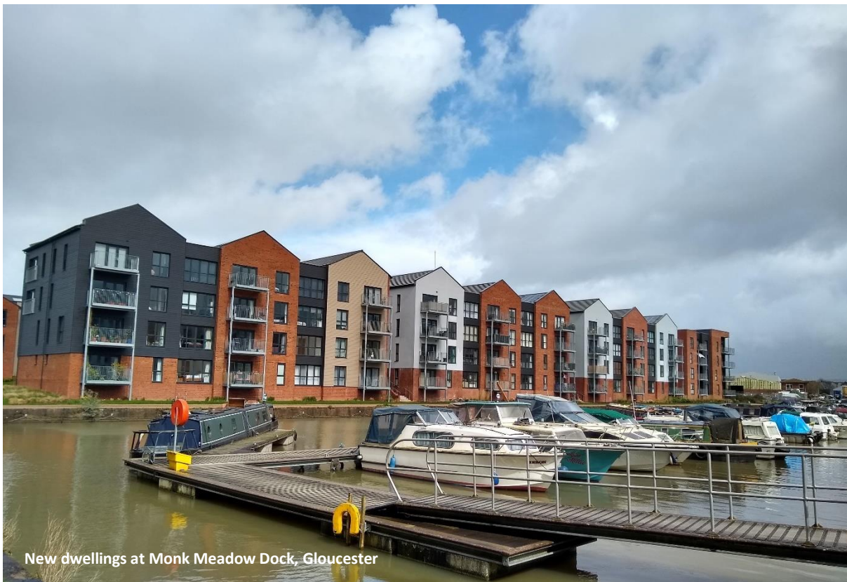
New dwellings at Monk Meadow Dock, Gloucester