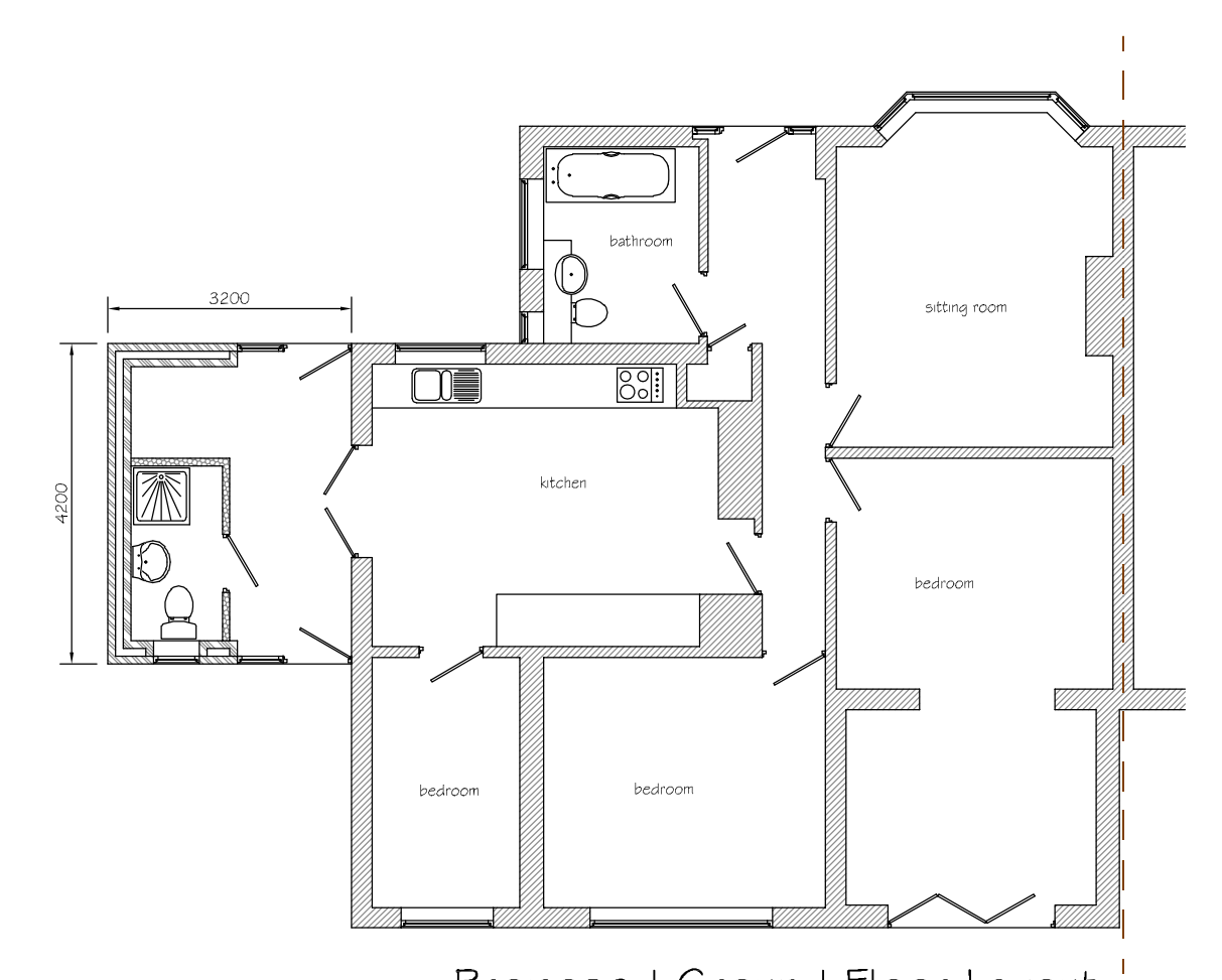
Proposed Ground Floor Layout