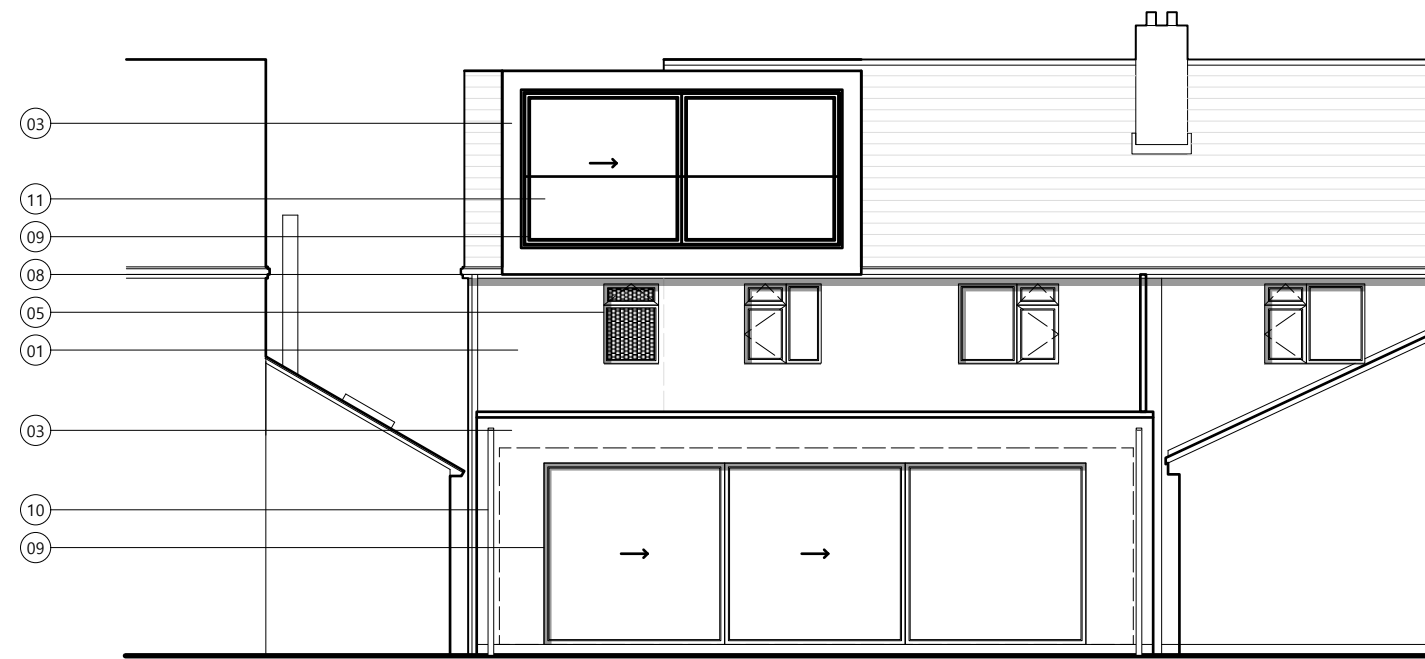
Rear Elevation 94 Oxstalls Lane, Longlevens 96 Oxstalls Lane, Longlevens 98 Oxstalls Lane, Longlevens