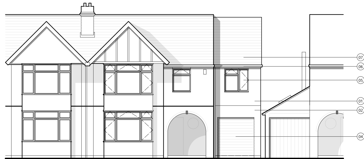
Front Elevation 98 Oxstalls Lane, Longlevens 96 Oxstalls Lane, Longlevens 94 Oxstalls Lane, Longlevens

01.06.22: TB - Drawing Created. A: 03.10.22: TB - Reduction in ridge line by 150mm following feedback from the Case Officer.