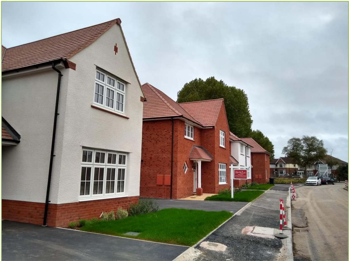
October 2021 - Completed new houses on 'former Civil Service site' off Denmark Road, Gloucester.