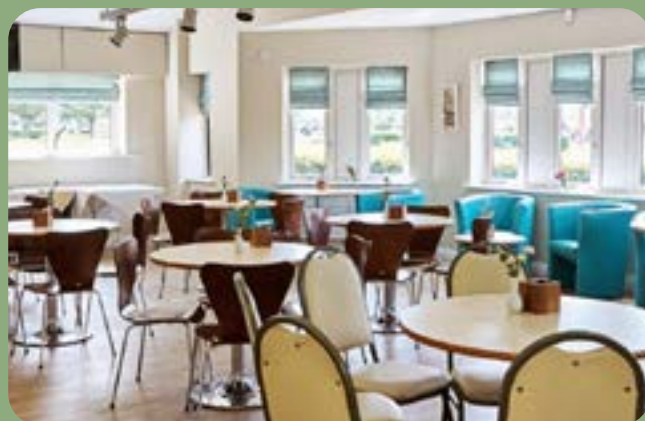
The Willows Tea Room