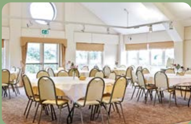
The Mulberry Wake Room

The Willows Tea Room is open to the general public Monday to Friday from 10am to 4pm and offers a range of freshly brewed coffee and teas, sandwiches, toasties, soup and handmade cakes. We do have highchairs and baby changing facilities and are able to heat food if required.