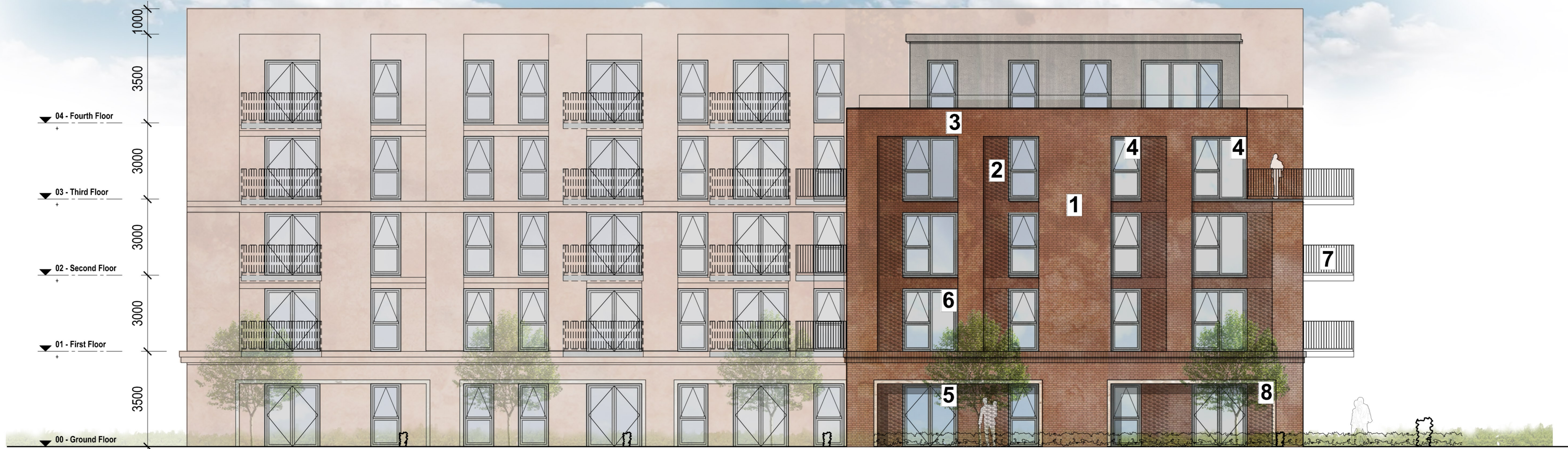
C Elevation C SCALE 1:125