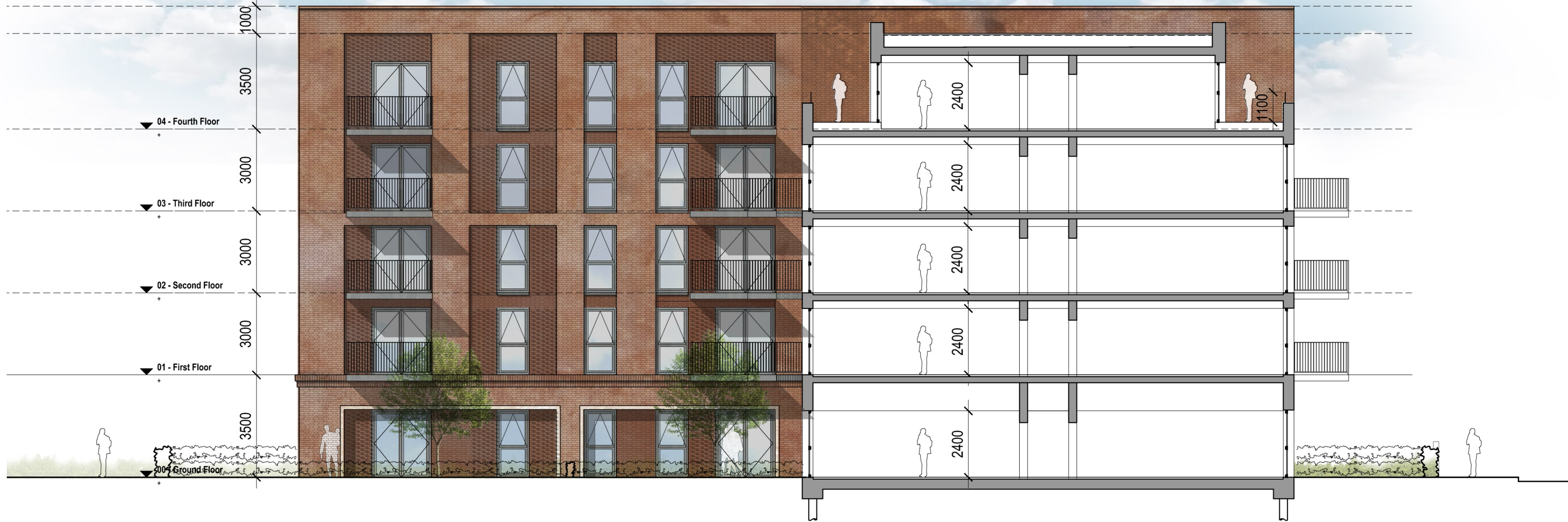
E Elevation E SCALE 1:125